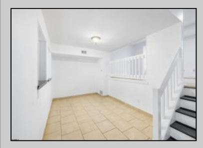
4952 Flintshire Mays Landing, NJ 08330