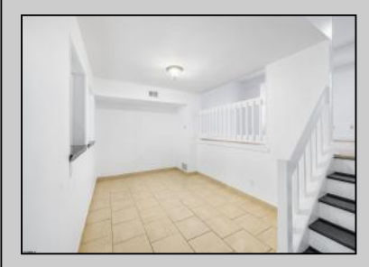
4952 Flintshire Mays Landing, NJ 08330