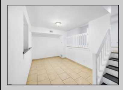
4952 Flintshire Mays Landing, NJ 08330