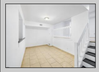
4952 Flintshire Mays Landing, NJ 08330