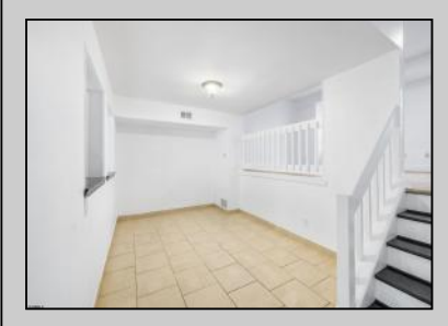
4952 Flintshire Mays Landing, NJ 08330