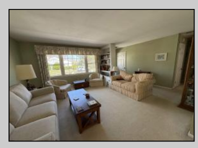
2501 Herbert Northfield, NJ 08225