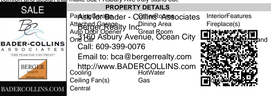
Sewer Public Sewer