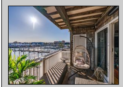
1302 Harbour Somers Point, NJ 08244