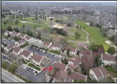
Greate Bay Golf Course