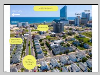
201 Grammercy Atlantic City, NJ 08401