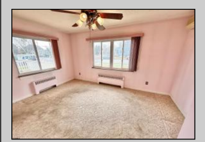
35 Johnson Ave Somers Point, NJ 08244