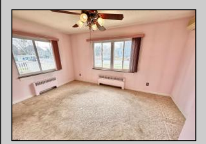
35 Johnson Ave Somers Point, NJ 08244