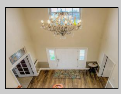
112 Wildflower Egg Harbor Township, NJ 08234