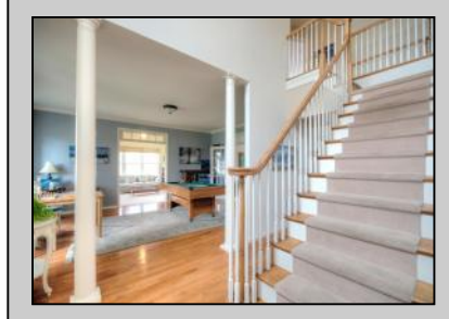
307 Arlington Egg Harbor Township, NJ 08234