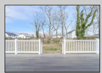
28 Thompson Pleasantville, NJ 08232