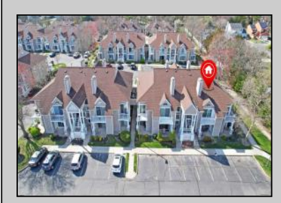
550 Central - H15 Linwood, NJ 08221