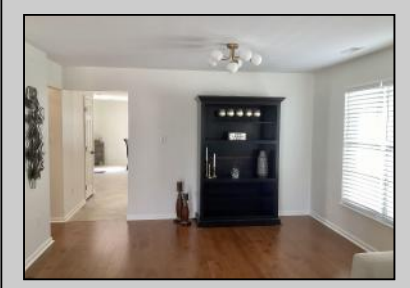
19 Gasko Rd Mays Landing, NJ 08330