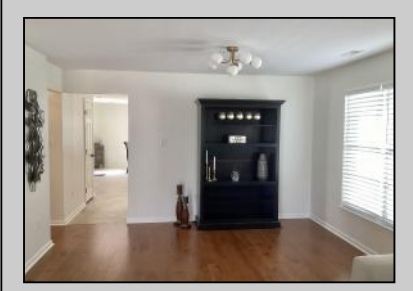
19 Gasko Rd Mays Landing, NJ 08330