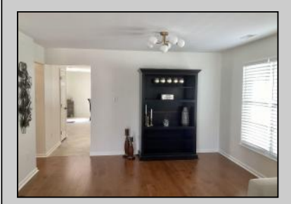
19 Gasko Rd Mays Landing, NJ 08330