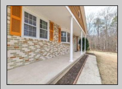
4246 Fairway Mays Landing, NJ 08330