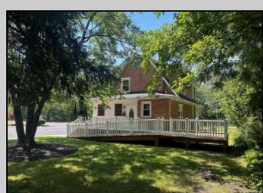
5467 Harding Hwy Mays Landing, NJ 08330