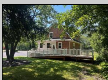
5467 Harding Hwy Mays Landing, NJ 08330