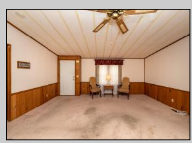
453 Priscilla Ln Buena Vista Township, NJ 08310