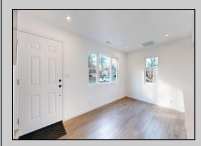
6310 Roberts Mays Landing, NJ 08330