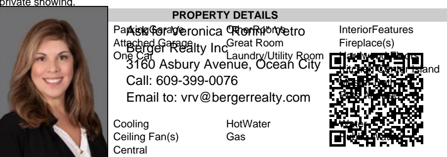
Sewer Public Sewer