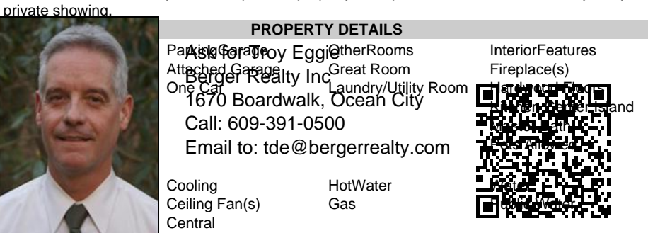
Sewer Public Sewer