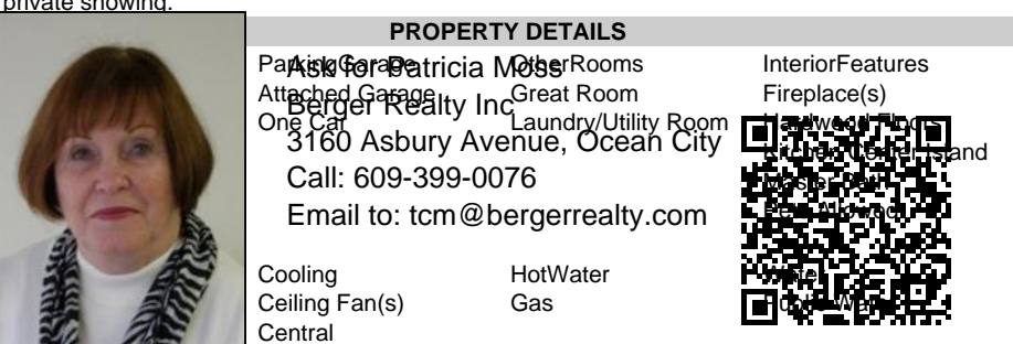
Sewer Public Sewer