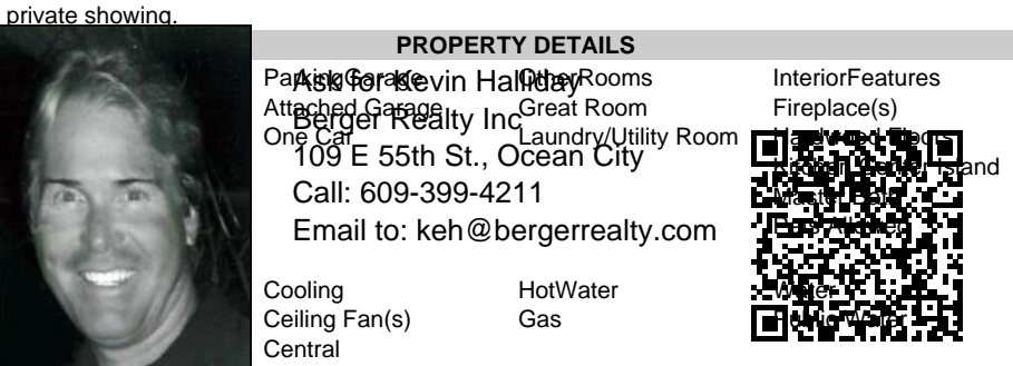
Sewer Public Sewer