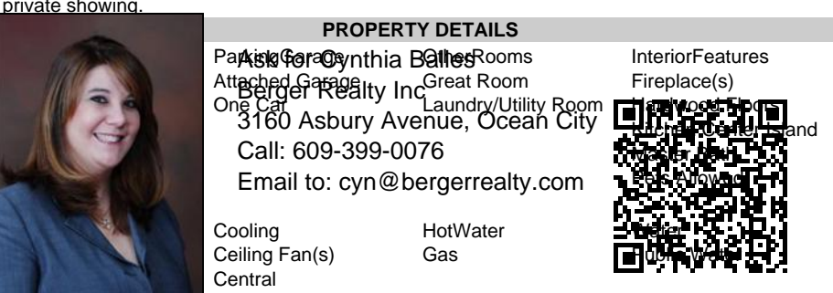
Sewer Public Sewer