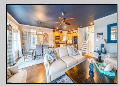
1944 Asbury Ave Ocean City, NJ 08226