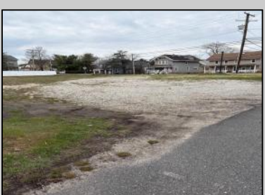
2351 Route 50 Tuckahoe, NJ 08270