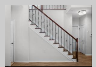
31 Poppy Rd Egg Harbor Township, NJ 08234