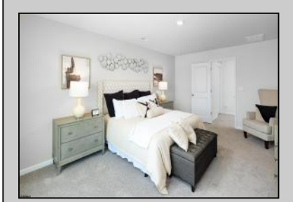
17 DEL RAY Egg Harbor Township, NJ 08234