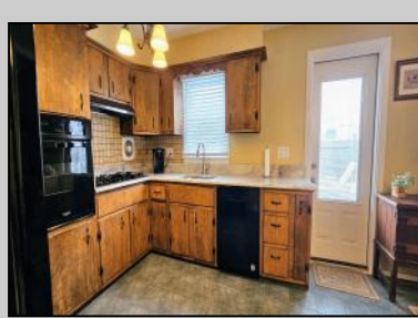
206 Ridgewood Dr Northfield, NJ 08225