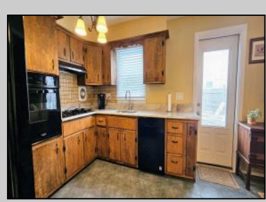
206 Ridgewood Northfield, NJ 08225