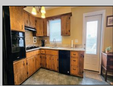
206 Ridgewood Dr Northfield, NJ 08225