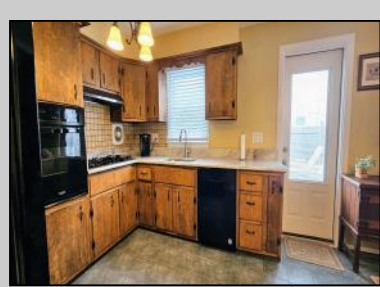
206 Ridgewood Northfield, NJ 08225