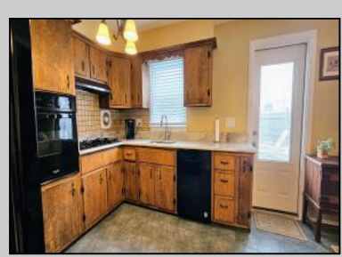
206 Ridgewood Dr Northfield, NJ 08225