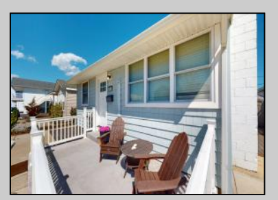
231 33rd Brigantine, NJ 08203