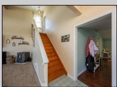
90 Schoolhouse Upper Township, NJ 08270