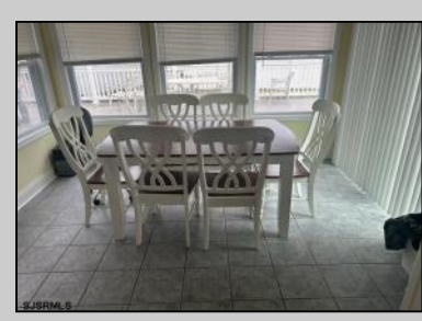
115 Cedar Ave Somers Point, NJ 08244