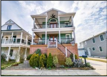
304 Essex Margate, NJ 08402