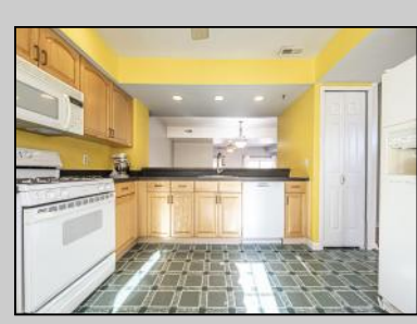
695 Lake Front Cir Galloway Township, NJ 08205