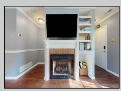
1532 Hamilton Ct Mays Landing, NJ 08330