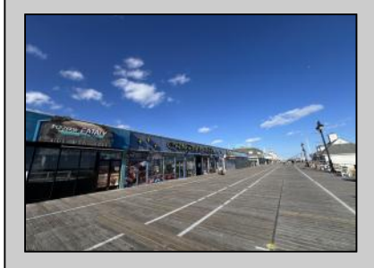
1214 Boardwalk Ocean City, NJ 08226