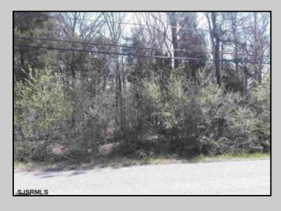
260 Odessa Egg Harbor City, NJ 08215