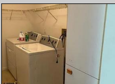
10 Starboard Atlantic City, NJ 08401