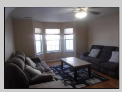
75 Anchorage Atlantic City, NJ 08401