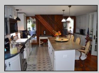
105 Thompson Egg Harbor Township, NJ 08234