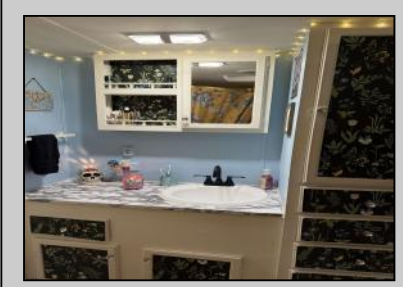
443 6th Ave Galloway Township, NJ 08205